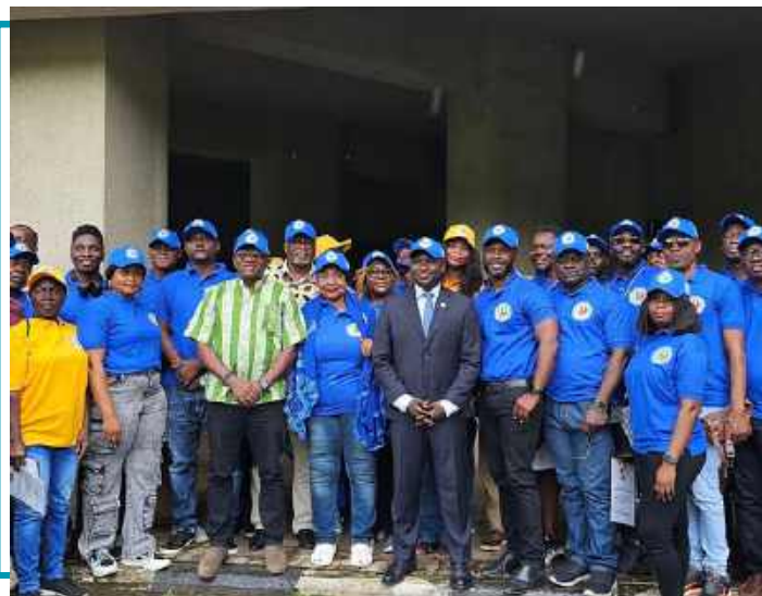
Minister Kpaka alongside Poultry Farmers at the Launch of the Buy Salone to Feed Salone campaign