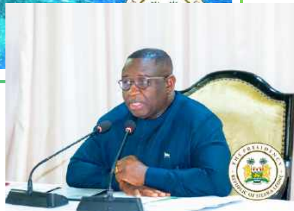
President Bio chairing the Presidential Council for Delivering Feed Salone, a manifestation of the whole-of-government approach in transforming food systems in Sierra Leone

The Council reviewed the past year's progress, discussed lessons learnt and outlined strategies to accelerate the program's impact. Minister Kpaka presented the Feed Salone One-Year Report summary highlighting major achievements.