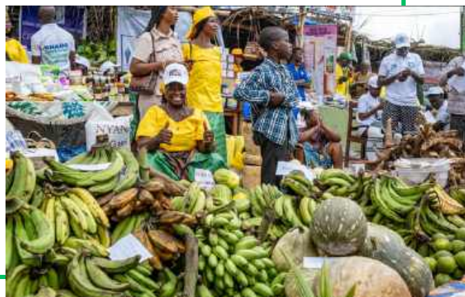
Farmers from all over the country showcased their produce on World Food Day

On October 16, 2024, Sierra Leone marked the first anniversary of Feed Salone and World Food Day in Kailahun under the theme Right to Food for a Better Life and a Better Future . The event showcased Sierra Leone's strides toward food security and equitable economic growth, driven by the Feed Salone program.