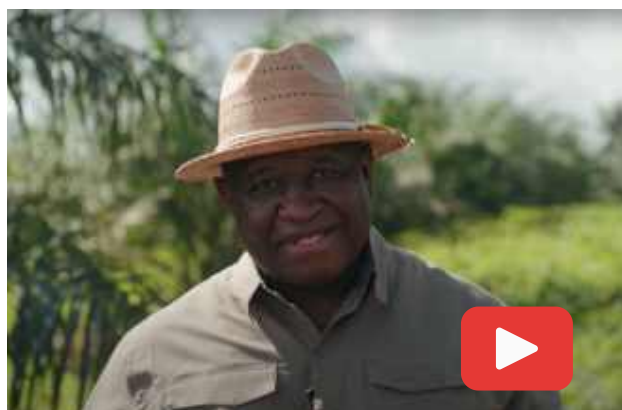
H.E. THE PRESIDENT, DR. JULIUS MAADA BIO

The Minister champions President Bio's Feed Salone and advocates for more cross-border efforts to enhance food security at the 2024 Borlaug Dialogue in Des Moines.